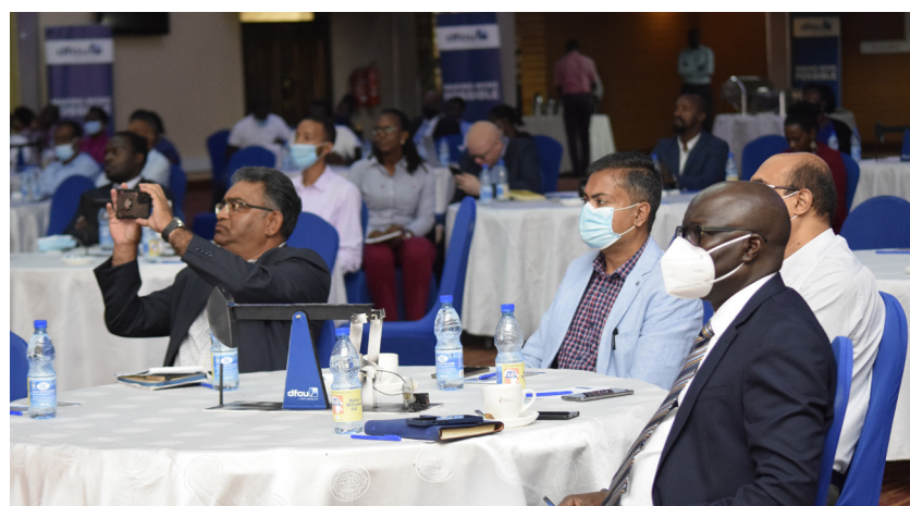
Possibilities in the Oil & Gas Sector: Held an engagement for key players to support local content participation.